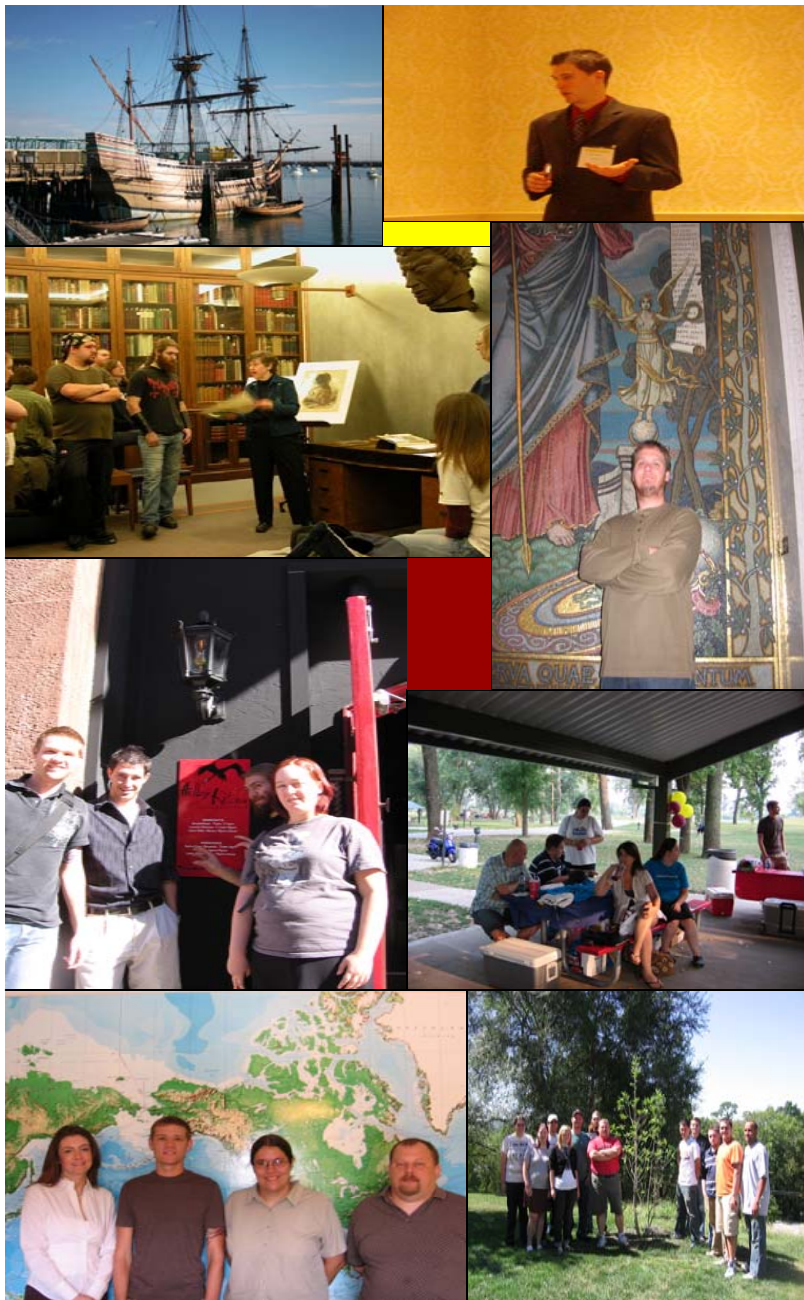
Phi Alpha Theta Midwest Regional Conference