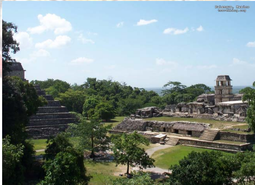
PALENQUE, MAYA RUINS, CHIAPAS, MEXICO

Each student is different and moves through college at a different speed. After your freshman year at Park, no one is going to expect you to know exactly what career you want to have for the rest of your life! As students progress through Elementary or Intermediate courses, they should be thinking about which aspects of the Spanish Major or Spanish Minor interest them the most. As your academic career continues, you may identify a professional area in which you can use your second language skills. In this case the Modern Language faculty can work with you on that choice.